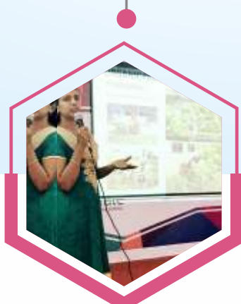
Workshop on Balanced Diet