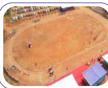
200mt Running Track