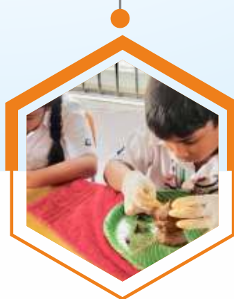
Workshop on Ganesh Idol Making