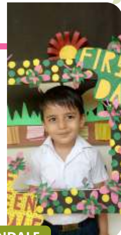
DAY 1 @ GREENDALE